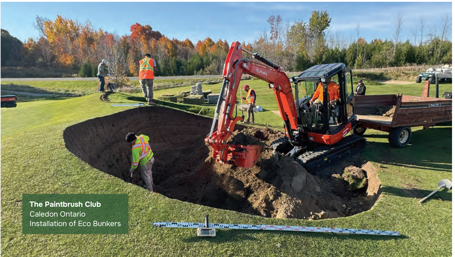
The Paintbrush Club Caledon Ontario Installation of Eco Bunkers