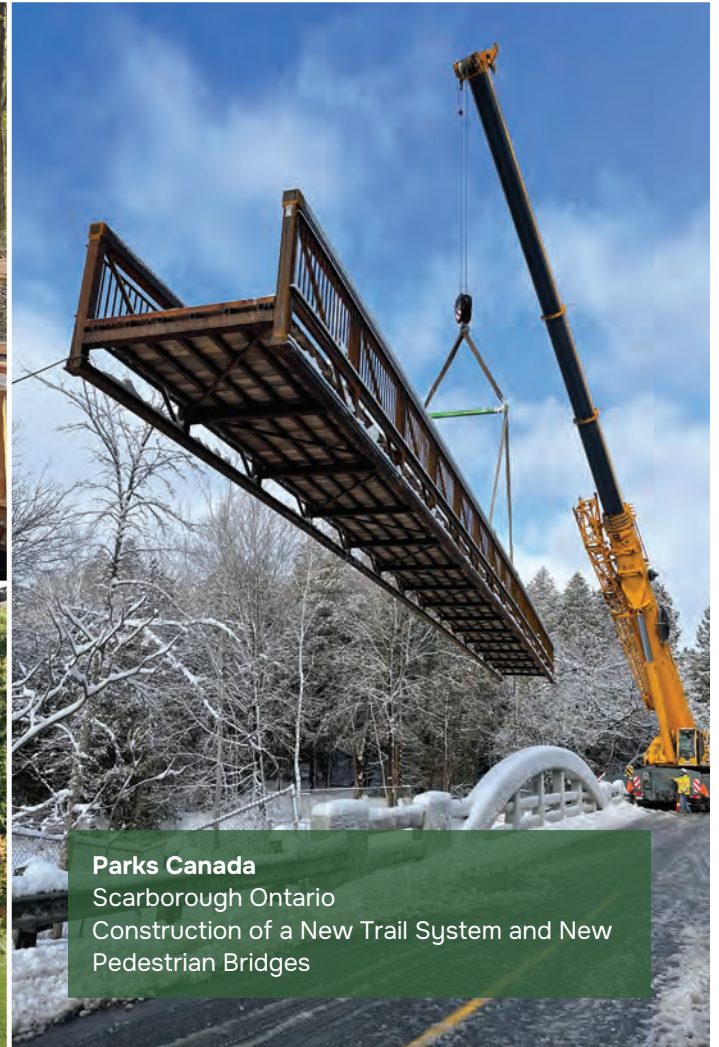
Parks Canada Scarborough Ontario Construction of a New Trail System and New Pedestrian Bridges