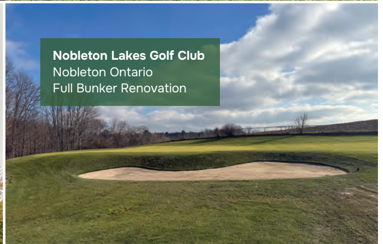
Nobleton Lakes Golf Club Nobleton Ontario Full Bunker Renovation