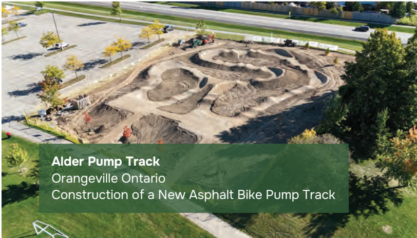
Alder Pump Track Orangeville Ontario Construction of a New Asphalt Bike Pump Track