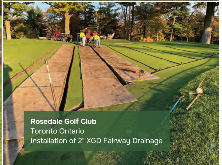
Rosedale Golf Club Toronto Ontario Installation of 2" XGD Fairway Drainage