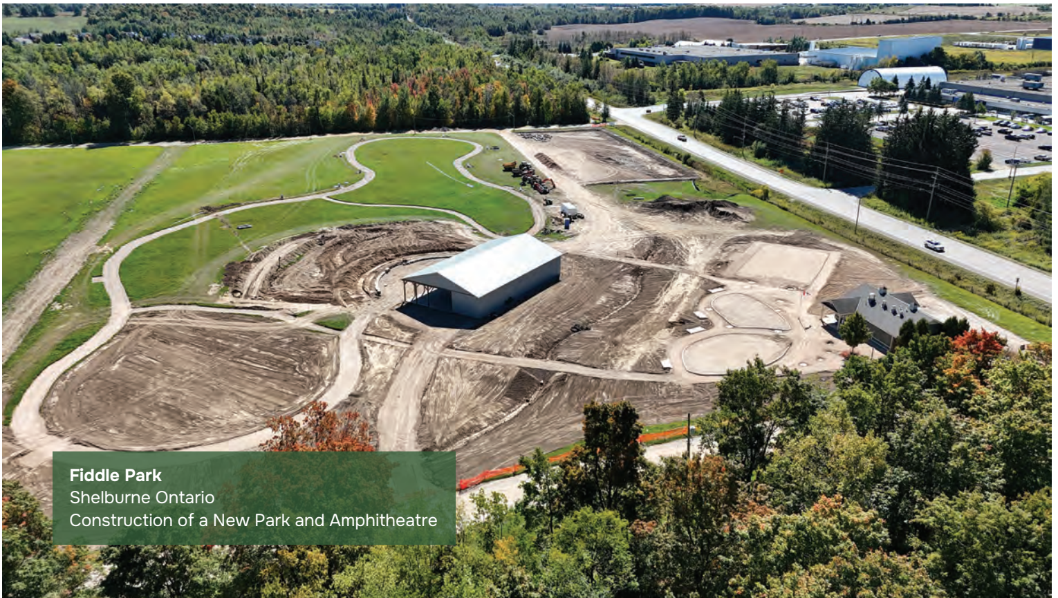
Fiddle Park Shelburne Ontario Construction of a New Park and Amphitheatre