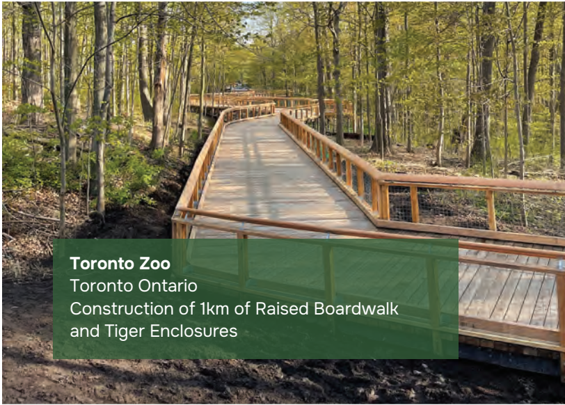
Toronto Zoo Toronto Ontario Construction of 1km of Raised Boardwalk and Tiger Enclosures